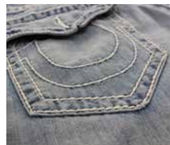
Thick thread fashion style