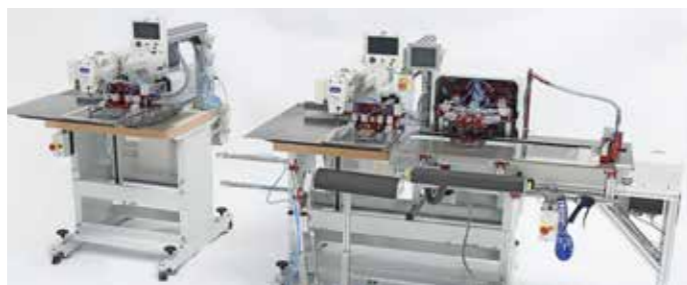
PS342-FG2SIP.V2 Sewing Unit with 2nd module